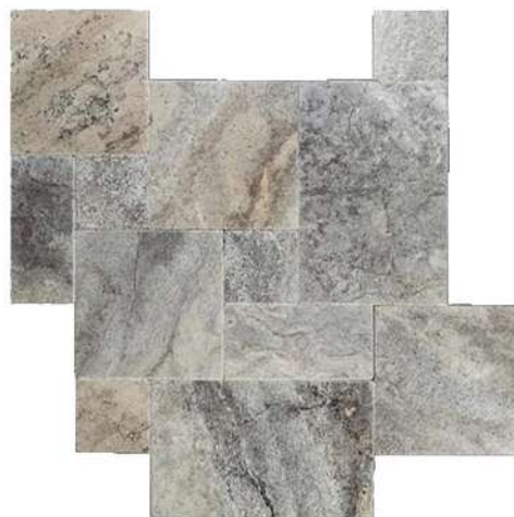
Venition Gold Versailles