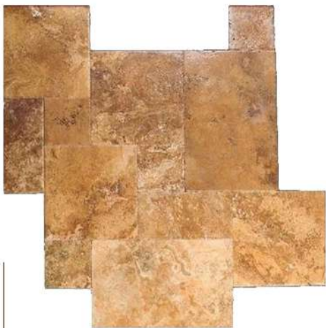
Venition Gold Versailles